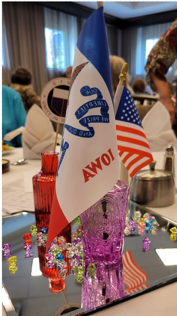
Table favor at MVR Luncheon