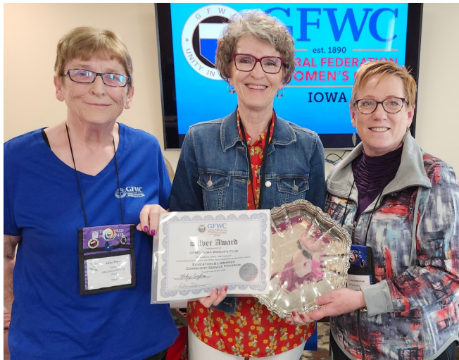
Education and Libraries Silver Award being presented to Woman's Club, Maquoketa