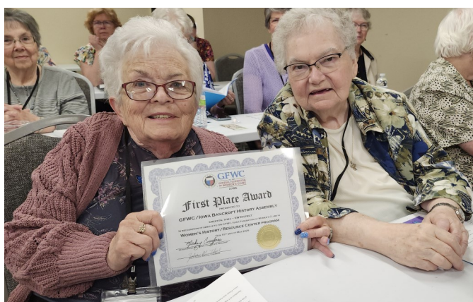
WHRC 1st Place award being presented to Bancroft History Assembly, Creston