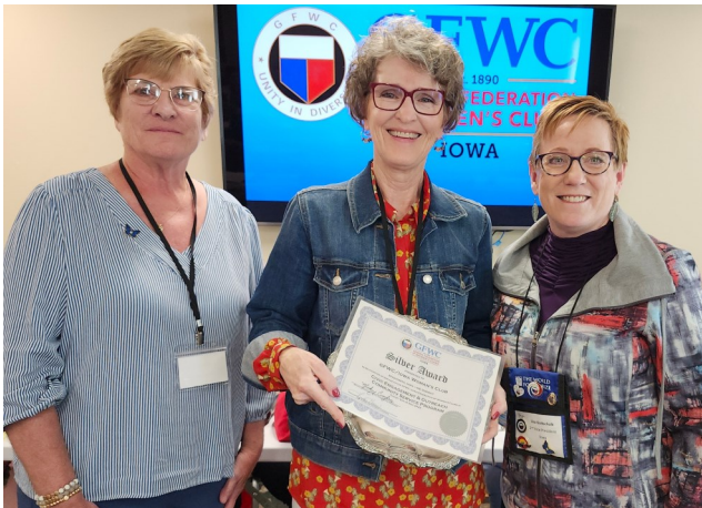
Civic Engagement and Outreach Silver award being presented to Woman's Club, Maquoketa