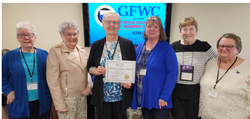
Fundraising Chairman's Choice award being presented to R.A.R.E. Club, Walker