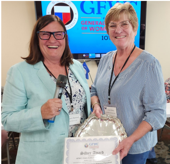
Environment Silver award being presented to Aurelia Women's Club