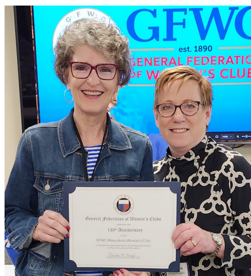
130th Club Anniversary certificate being presented to Maquoketa Woman's Club