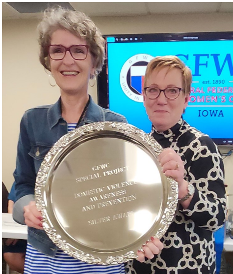
Domestic and Sexual Violence Awareness and Prevention Silver award being presented to Womans Club, Maquoketa