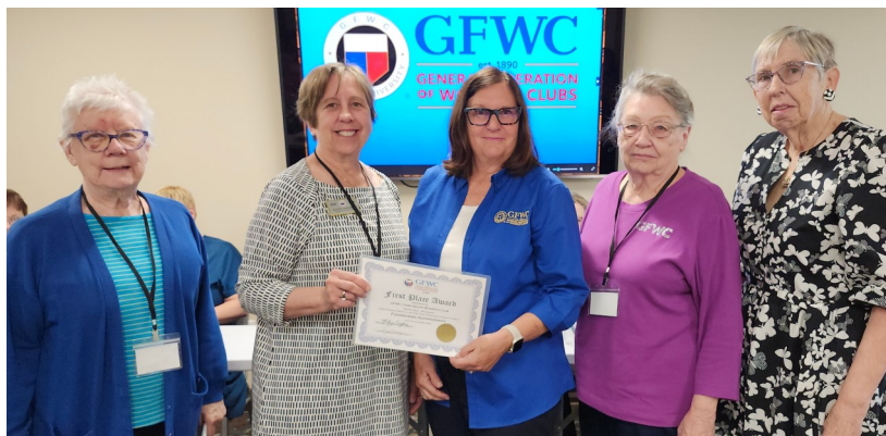
Fundraising 1st Place award being presented to Solon Women's Club